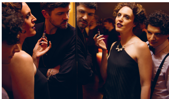
Il barbiere di Siviglia