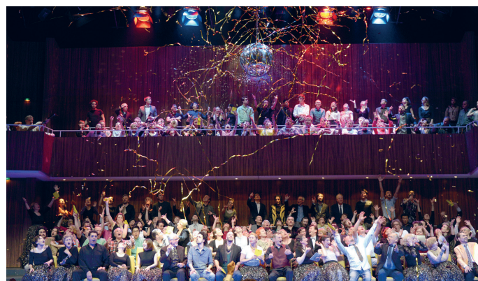
Rigoletto © Bettina Stöß